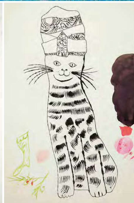
Opposite page: André Masson's Les Métamorphoses du Sommeil This page (clockwise from top): Christo et Jeanne-Claude's Surrounded Islands, Biscayne Bay, Greater Miami, Florida, Collage; Jean Dubuffet's Racccommodeuse de chaussettes (W21) Matière et Mémoire; Andy Warhol's Cat with Turban